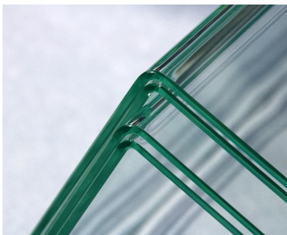
Picture 2: Using the new laser-based glass-bending process, it is possible to achieve precisely defined and extremely small bend radii, so that even laminated safety glass can be bent around a corner. The sheets of glass in the image are three millimeters thick.