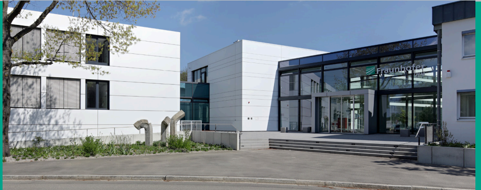
Fraunhofer IWM, Freiburg.

FRAUNHOFER INSTITUTE FOR MECHANICS OF MATERIALS IWM